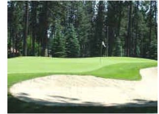
15 th Green at CDA Public

We are also offering a fun play option for those of you who may not want to compete and maybe just want to come out and see what the championship is all about. Pricing will be available as we get closer to the event. More information will be available in the coming weeks, until then, Get Out There and Golf Ladies!