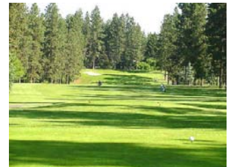
3 rd Hole at CDA Public

Check out our website for the latest EWGA Inland Northwest Chapter information.